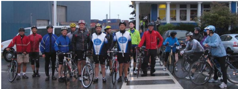
A group of riders prepare to set off from the Mission's 'blue house'.

Next year's ride will be held September 15, 2012. More information and pictures of both events are posted on the Mission's website: www.flyingangel.ca D.R.